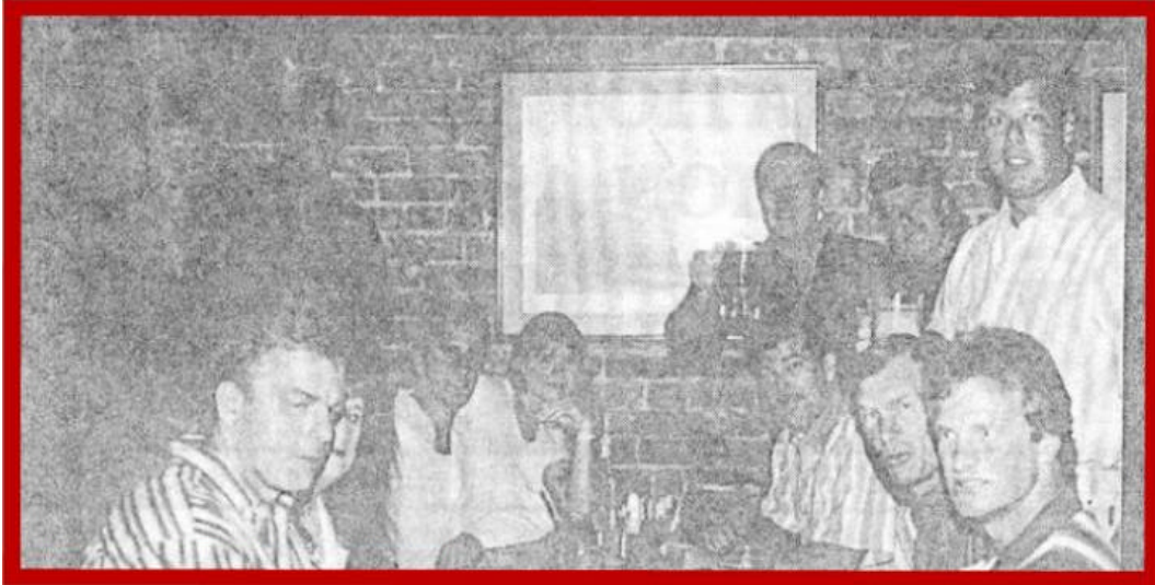
SOME OF THE GANG ON BOURBON STREET

interest and are in perfect harmony with one another. Suddenly, strangers become fast friends and a world of sharing begins. We had a blast at the seminar and socially as well. Except for getting separated on the way to new Orleans and having to find each other on Bourbon Street in the French Quarter on a Saturday night, everything went great.